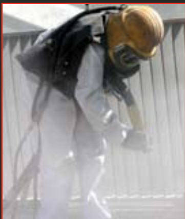
Conventional Grit Blasting