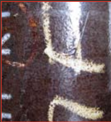
API 5L Piping