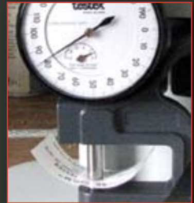
• 83 R c (3.3 mil)